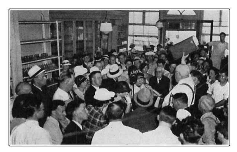
Auction Sale of Leadbeater Pharmacy, Alexandria, Va., July 19, 1933. The sale took place in a room next to the old pharmacy.